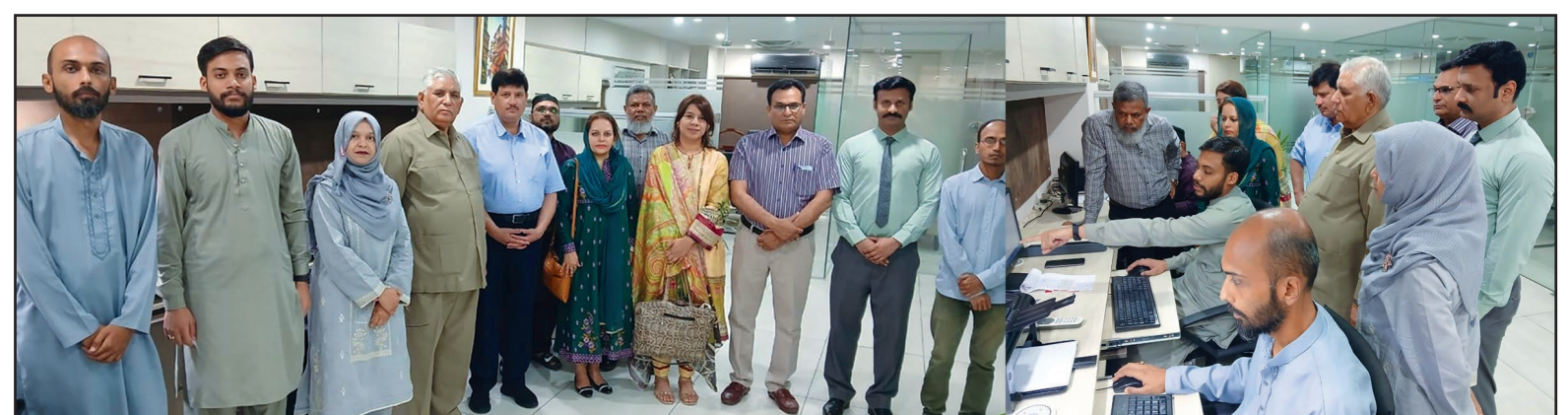
Editorial Staff members of Pakistan Journal of Medical Sciences photographed alongwith the visiting CMJE Batch-2 participants in offices of Pakistan Journal of Medical Sciences on June 12, 2024.