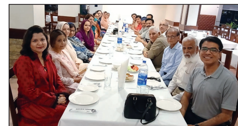
Pakistan Journal of Medical Sciences hosted a dinner in honour of the visiting CMJE Batch-2 participants on June 12th, 2024.