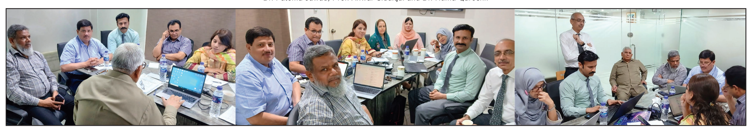
A view of the Internship training session for the CMJE Batch-2 in progress at the offices of Pakistan Journal of Medical Sciences on June 12th 2024.