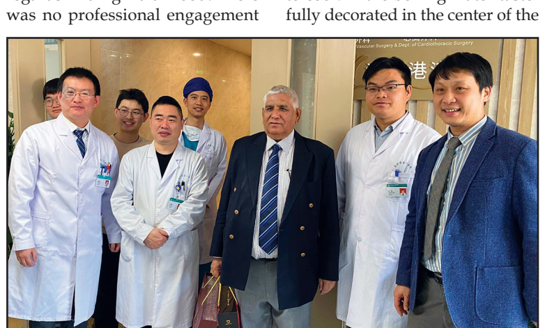
With faculty members of Dept. of Cardiovascular and Thoracic Surgery at First Changsha Hospital on March 26th 2024.

orders from the business class pasearly at 6.00 AM. After shower I sat beside the window and had good ngers and let me confess this was my first travel in Business Class in view of the city. Many people were ers and then the waitress brought jogging on the river bank but I decided against and had about twenty minutes' walk in the room. We had agreed to meet at 8.30 AM in the lobby to have breakfast together. Once Alex Li came, we went to the breakfast area. There were five different sections in the big restau- of mushrooms, vegetables and rant and there was no problem as noodles which we were supposed regards finding Halal Food. There to cook in the boiling water taste-